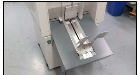
Reception with capacity up to 250mm (5 reams ~ 2 500 sheets)