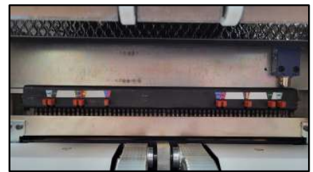
Wide range of quality 14" punch dies with retractable pins and backward compatibility with the previous range of dies