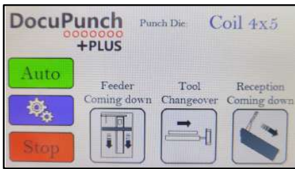
New easier-to-use colour touch screen interface