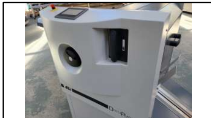
New front casing with modern design