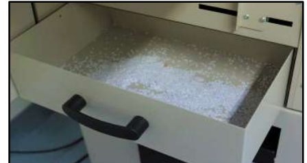
Large capacity waste bin