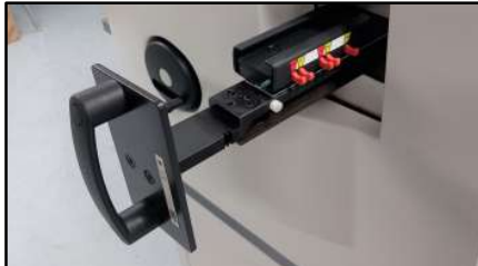
Easy tool change in less than 2 minutes