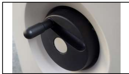
Easy format set-up with simple hand wheel activating all side lay gauges