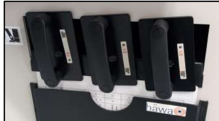
Storage space for 3 dies