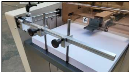
New feeder with improved settings and more robust design. Capacity up to 250mm (5 reams ~ 2 500 sheets)